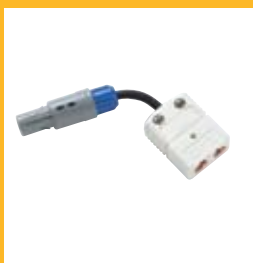
Universal Thermocouple Adapter