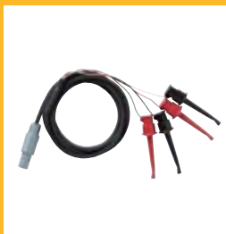
Universal RTD Adapter