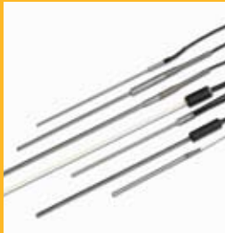
Calibrated Temperature Sensors

A wide array of accessories is available to help you maximize productivity, but the following are essential for most users.