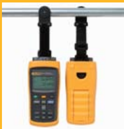
TPAK Magnetic Hanger