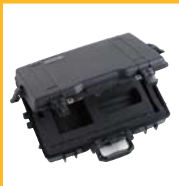
Probe and Readout Case