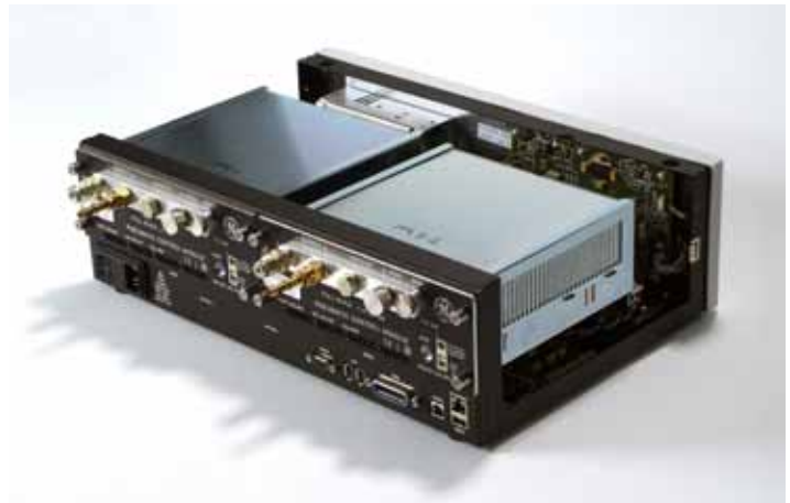
Pneumatic Control Module