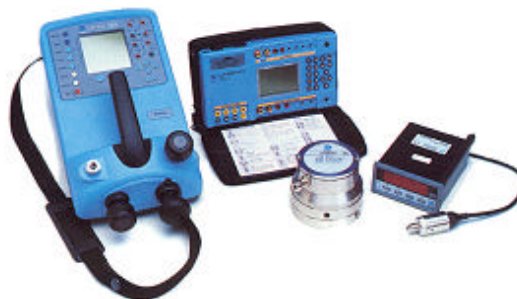
Pictured Left to right DPI 610 Field Portable Pressure Calibrator TRX-II Portable Documenting Process Calibrator LPM 9000 Low Pressure Transducer DPI 280 Digital Process Indicator

Druck manufactures a wide range of pressure transducers and transmitters, associated digital indicators, barometers, and a complete range of precision process calibrators and controllers for the field, workshop and laboratory.